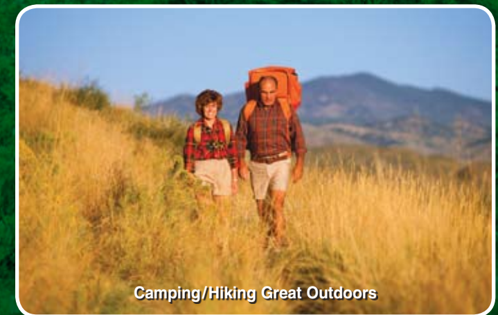
Camping/Hiking Great Outdoors