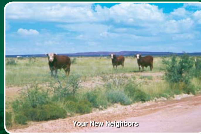
Your New Neighbors