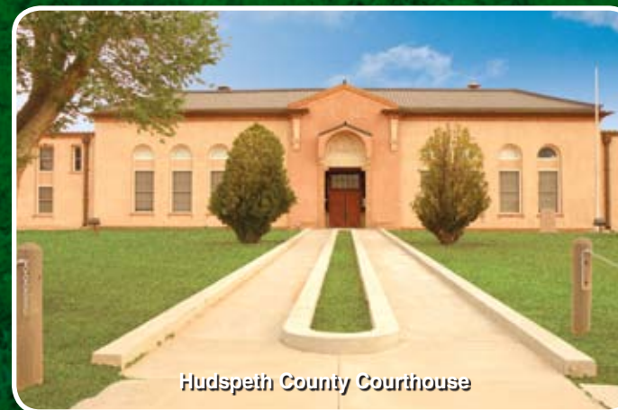
Hudspeth County Courthouse