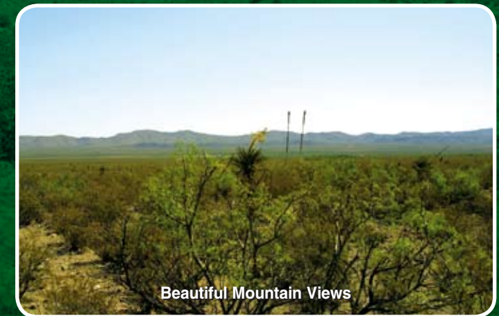
Beautiful Mountain Views