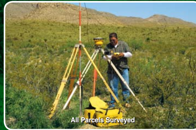
All Parcels Surveyed