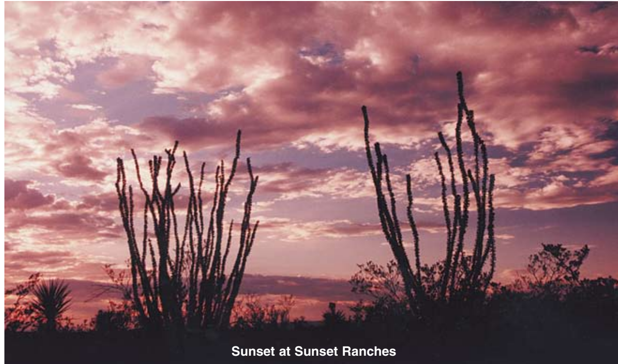
Sunset at Sunset Ranches

Thousands have discovered the benefits of owning a piece of the GREAT SOUTHWEST at SUNSET RANCHES. Buy now while prices are affordable.